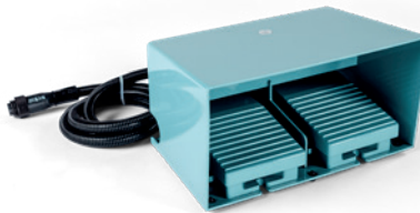
Foot pedal as an option.