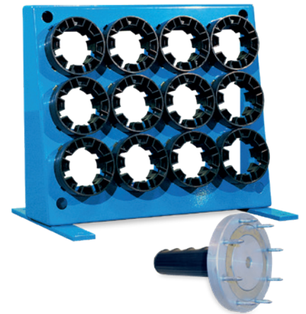
Tool base and Tool rack with QuickChange-tool as an option.