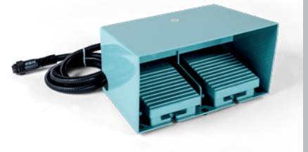
Foot pedal as an option.