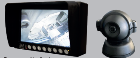
Camera with display as a standard feature.

Oil Condition Monitoring OCM Adapter dies for 160-series die sets, L220 (part no 404916) Oil cooler J3