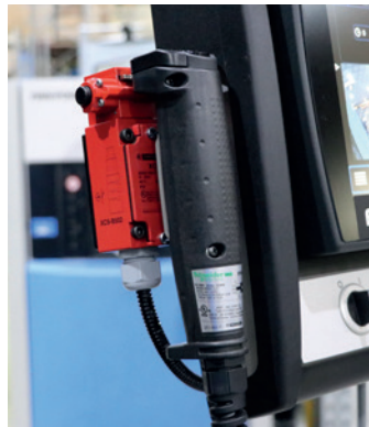
Remote control unit as a standard feature.