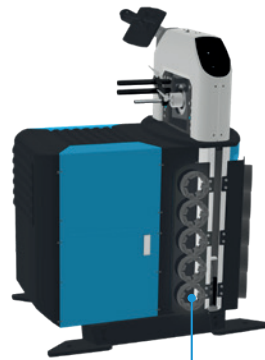
Side die rack as an option, 5 slots (Compact only)