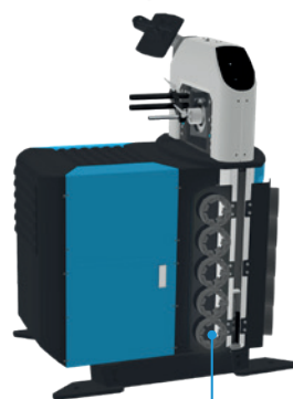
Side die rack as an option, 5 slots (Compact only)