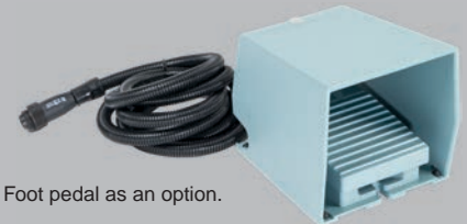
Foot pedal as an option.